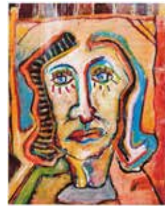
A BLINK OF A WISE WOMAN 2023