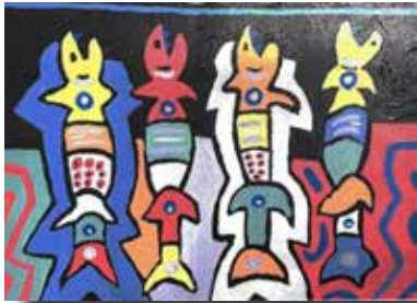
FOUR FISH 2021