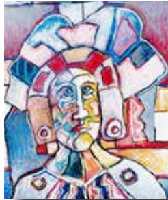
GUARDED WOMAN 2022